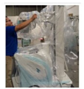
Step 2. . Remove 42" x 120" bag and place over fully extended XR tube and column