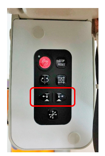
Fig.8 Single-Axis Movement Buttons