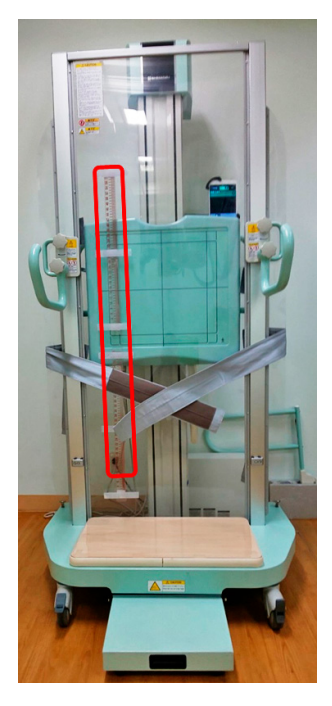
Fig.4 Fender Wall for Long View Radiography With a Fixed Measuring Ruler. Hand Grips on both Sides and Belt for Trunk Restraint

board of the fender wall. There are two pins on the bottom at the front of the fender wall on either side that lock the fender wall in place once moved into a specific position. This lock can be released by moving the fender wall while depressing either one of the pins.