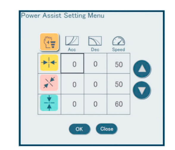
Fig.7 Power Assist Setting Menu Acceleration, deceleration, and optimum speed can be adjusted along each axis of motion.