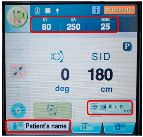
Fig.3 LCD Screen

The X-ray tube support control unit has a liquid crystal display (touch panel) that displays the patient's name and SID, and can also be used to adjust radiographic conditions and irradiation field size (Fig. 3). The X-ray tube support has a vertical travel range of 1,600 mm and can be rotated freely and fixed at any angle on the vertical axis.