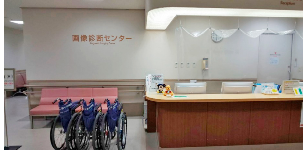
Fig.2 Diagnostic Imaging Center Reception

The general radiography examination room is located in the Diagnostic Imaging Center (Fig. 2) on the first basement floor of ward 3, where one dedicated chest radiography system and four