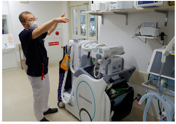
Thanks to the collapsible column, the system can even be stored under shelving.

COVID-19 cases have a scheduled morning examination consisting of chest radiography once a day, apart from Mondays when both chest radiographs and abdominal radiographs are taken. When beds are full, this entails all 10 patients performing 20 radiographic examinations. After including non-COVID-19 patients, about 25 examinations are performed in total, which takes around 1 hour 30 minutes. Apart from scheduled examinations, radiography is also used during the day shift to confirm the position of endotracheal intubation tubes after reinsertion or repositioning, to confirm feeding tube insertion, or after replacing a central venous catheter. Radiography is also used when patients