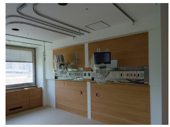
Nine of 22 general ward beds converted to negative pressure rooms

Foreseeing that COVID-19 would continue into the future, from November through to January the center undertook renovation work to create negative pressure rooms. All ICU rooms were converted, as were 9 of 22 general ward beds (among 8 HCU beds and 14 general beds). Treatment areas that are entered by patients such as the emergency room, the CT room, angiography room, and operating room were also converted. Performing renovation work in all ICU rooms and 70 % to 80 % of treatment areas while also continuing to treat severe COVID-19 cases was a difficult task, but undertaken for the protection of patient and staff safety.