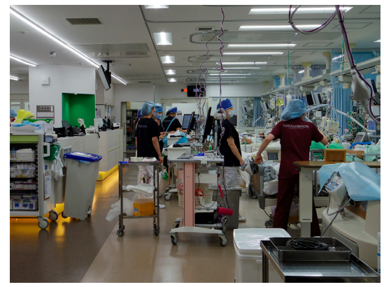
All 8 ICU beds converted for negative pressure operation due to the pandemic

COVID-19 treatment areas and other areas in the hospital, and obtaining personal protective equipment for infection control. Also, PCR testing was only available through the government at the time and the government was cooperative, but since nearby Higashiosaka City Medical Center obtained PCR testing equipment, we have coordinated with them on diagnosing COVID-19. The initial State of Emergency caused a slight reduction in severe cases during April and May of 2020, but as the only tertiary emergency and critical care facility in the region, we also needed to maintain local emergency services, and for a period of 1 year we continued to provide emergency medical services alongside treatment for severe COVID-19 cases.