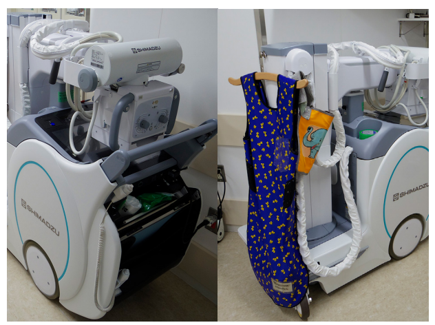
During hospital rounds, plastic bags and cleaning wipes for infection control are stored in the rear storage box of the MX8 (left). A protective apron is also carried on a hanger from the hook on the support column.

Nakamura In terms of moving the system and system operability, I have seen female radiological technologists in training using the MX8 with no apparent difficulty.