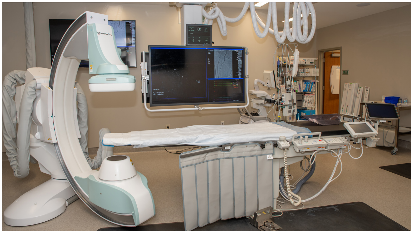
FIGURE 2. The surgical suite features cutting-edge Shimadzu technology.