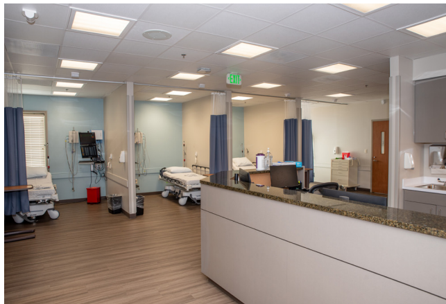
FIGURE 3. The Cardiology Consultants PA holding area.

The OBL uses a hemodynamics unit from Fysicon. “It documents a patient’s journey from arrival in the pre-procedure area to procedure room and back. It tracks hemodynamics throughout, clinical updates,