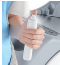
Wireless hand switch

A wireless hand switch or IR remote controller allows you to perform exposures remotely for even more easibility.